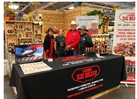
Sampling booths from 2022-2024 shown above. 2025 booth layout will vary

The goal of this program is to educate over a half-million annual fair guests about the delicious bounty of our state and all of the farms, kitchens, factories, hearts and hands that bring food to our tables. Taster's Row is designed exclusively for growers, producers and processors of California agriculture and food products. Cottage Food Industry producers are welcome! All booths include an educational aspect and free food sampling for fair guests. Make a direct connection with your consumers in the California's Kitchen Exhibit.