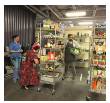
Ingredients & Supplies, Theatre Backstage

Share your enthusiasm and knowledge for all things food and cooking by becoming a Demonstrator at the California State Fair! Promote your restaurant, food truck, cookbook, cultural cuisine, web blog, healthy lifestyle message, or personal passion. Our goal is to educate over a half-million annual Fair Guests in the internationally-awarded Save Mart Supermarkets California's Kitchen exhibit.