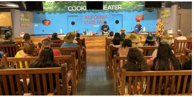
Cooking Theatre Stage (2023)