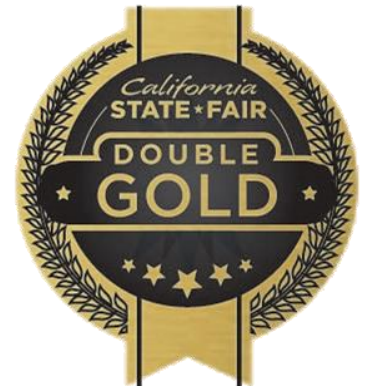
(4.5cm x 5cm)