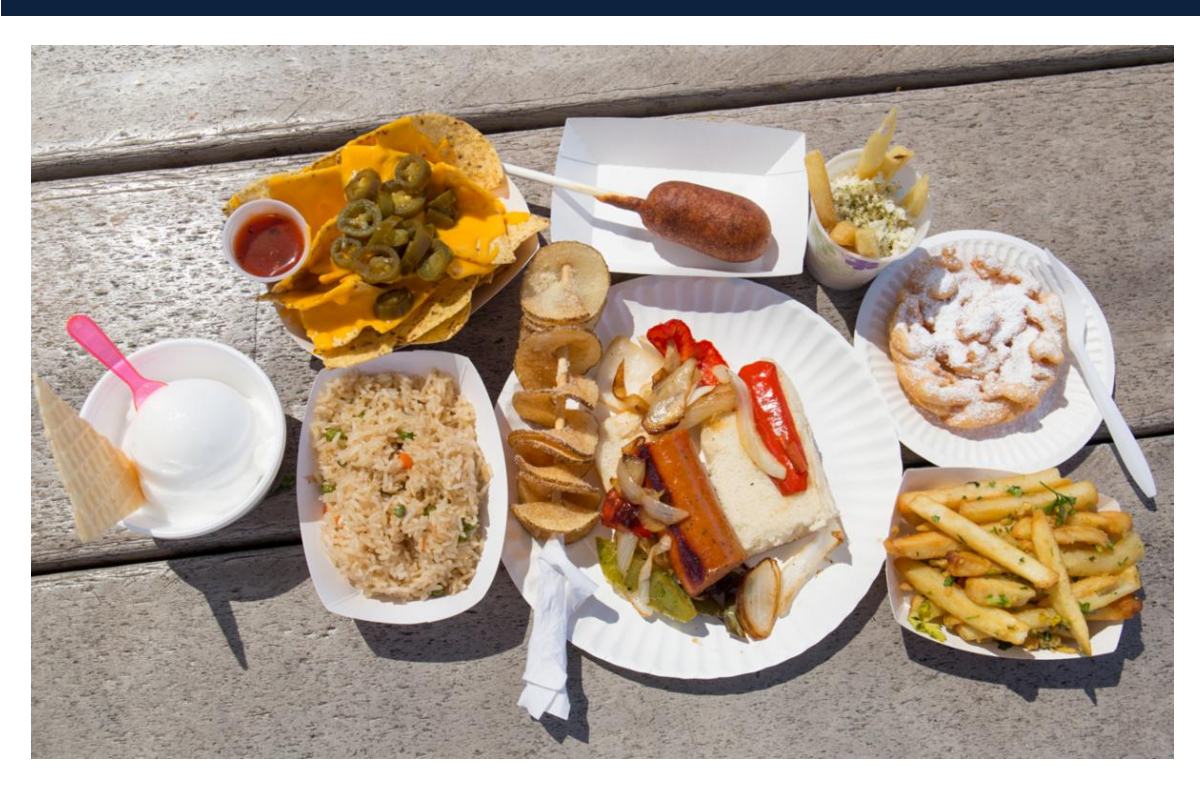
$2 Taste of the Fair Wed. & Thurs. 11am - 4pm

Come experience one of the best ways to eat at the California State Fair. On Wednesdays and Thursdays from 11:00 a.m. to 4:00 p.m. every food vendor will have a special item for only $2. Stop by each booth and ask what their $2 Taste is, or click the button to see the full menu.