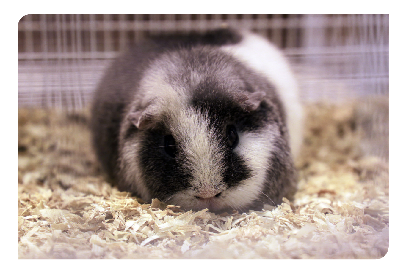
California Small Animals | 15 | CalExpoStateFair.com

The Fair or a designated representative(s) shall check all animals upon arrival for poor health conditions, signs of communicable disease, external parasites, any unsightly disease condition, and any wounds, open or closed, that may be contagious. All animals will be inspected before cooping in. Any animal showing evidence of disease or parasites, including lice and mites, shall be immediately removed from the Fairgrounds. Decisions of the inspection committee are final. After coop-in, the Fair shall have the right to enter any pen/coop to inspect an animal. Any animal found to be in an unsafe or unsightly condition will be quarantined in a designated area and then dismissed from the grounds as soon as possible.