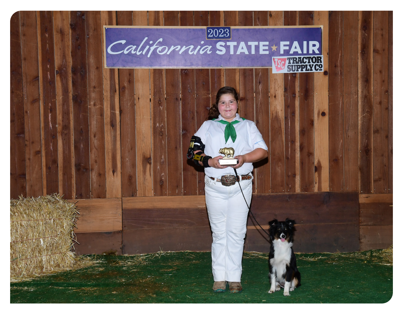
California Small Animals | 50 | CalExpoStateFair.com

First and second award winners in Junior Open and Senior Open Showmanship Classes are eligible to compete in Small Animal Master Showmanship on Friday, July 19. The Dog show Coordinator will provide animals for this competition.