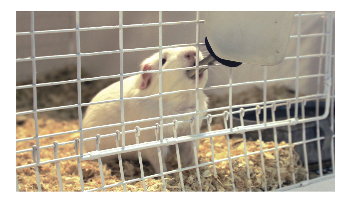
California Small Animals | 31 | CalExpoStateFair.com